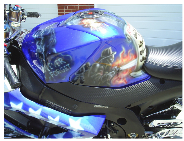
The side of the fuel tank