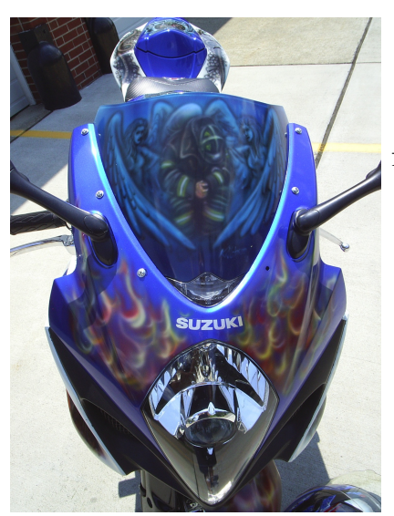
←A look at the front fender