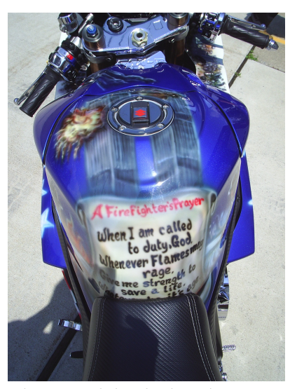
The top of the fuel tank