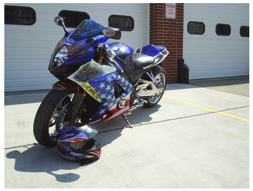
A look at the front of the bike.