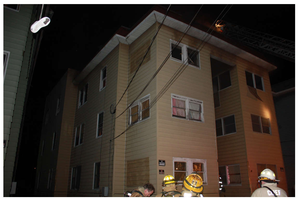
Smoke can be seen from 3<sup>rd</sup> floor windows as newly arriving crews get their assignments from the Chief.

ventilation. Due to initial reports that there may be children trapped on the third floor and the size of the building the Duty Chief struck a second alarm. Luckily the reports turned out to be false and all occupants were accounted for.