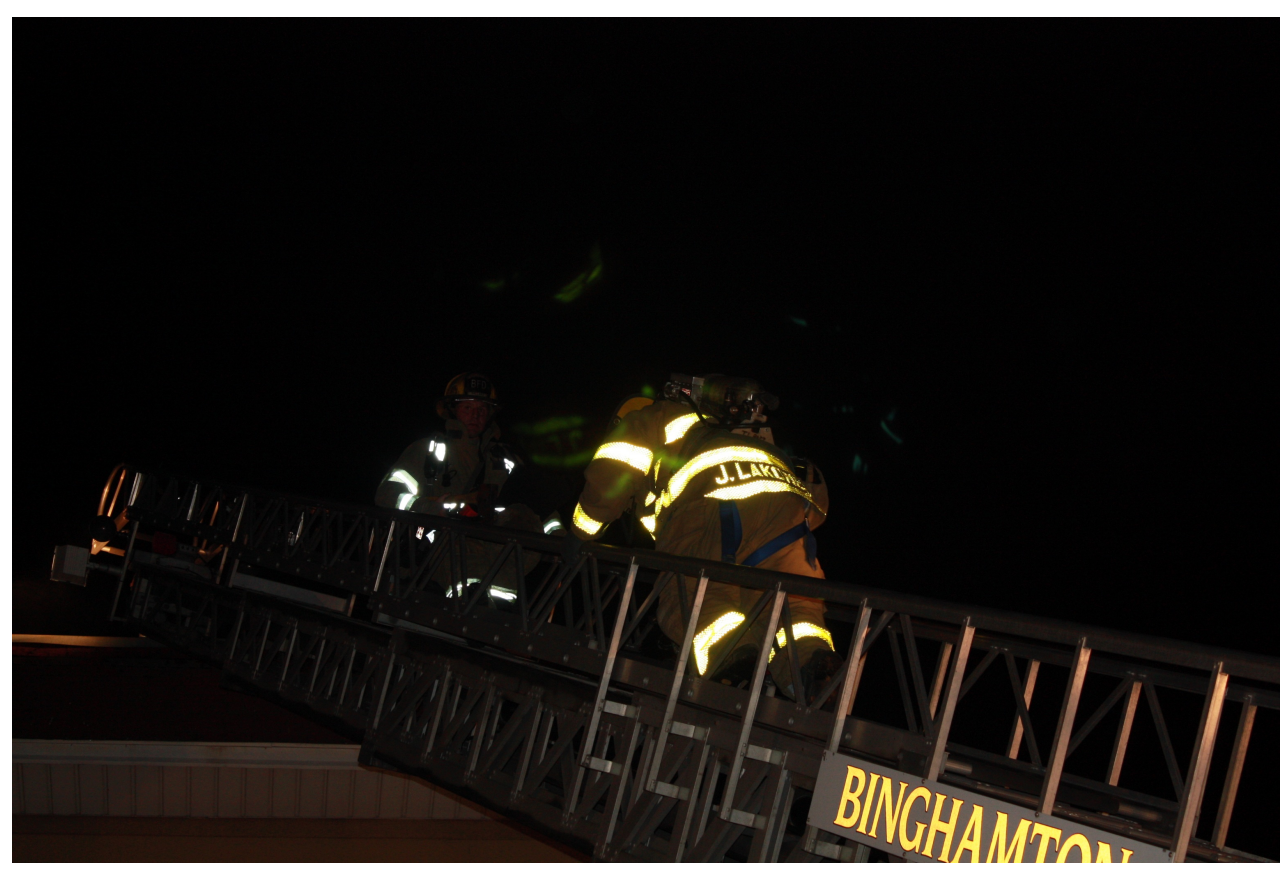
Part of Tower 21's crew descends Quint 2's aerial from the roof.