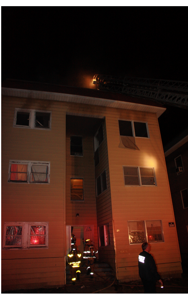
Part of Tower 21's crew enters the building to assist with overhaul as smoke still pushes from 3<sup>rd</sup> floor windows.

At 1947 hours on the evening of Wednesday March 7, 2012, while Group B was working, the Binghamton Fire Department was dispatched to alarm # 12-1561 for a reported fire at 17 Mygatt