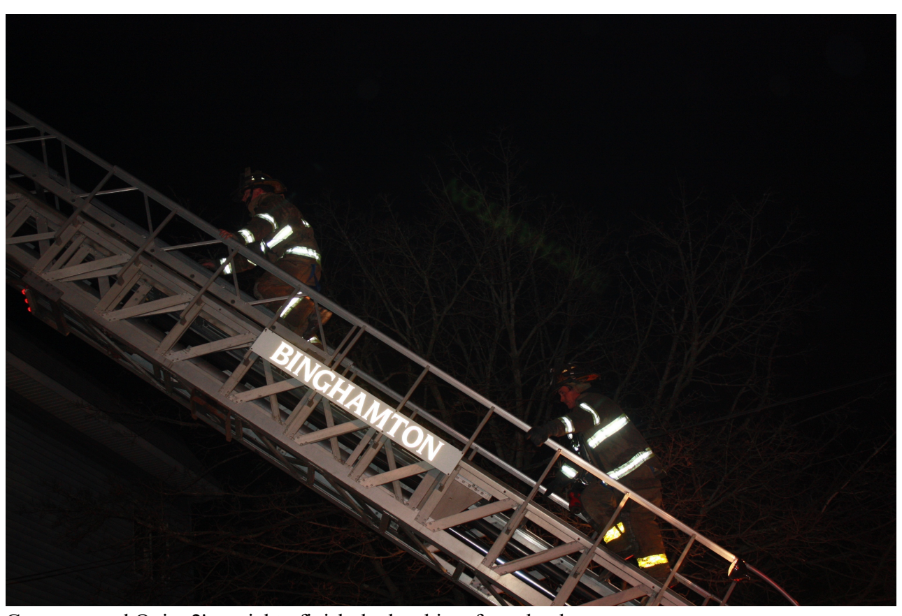
Crews ascend Quint 2's aerial to finish the last bits of overhaul.