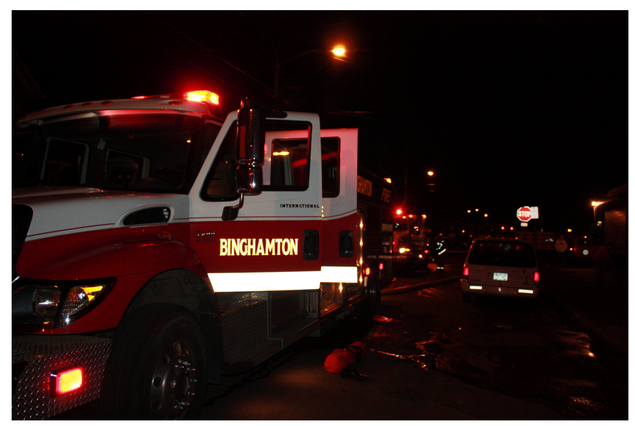
Squad 21's rig operates as water supply at the scene.