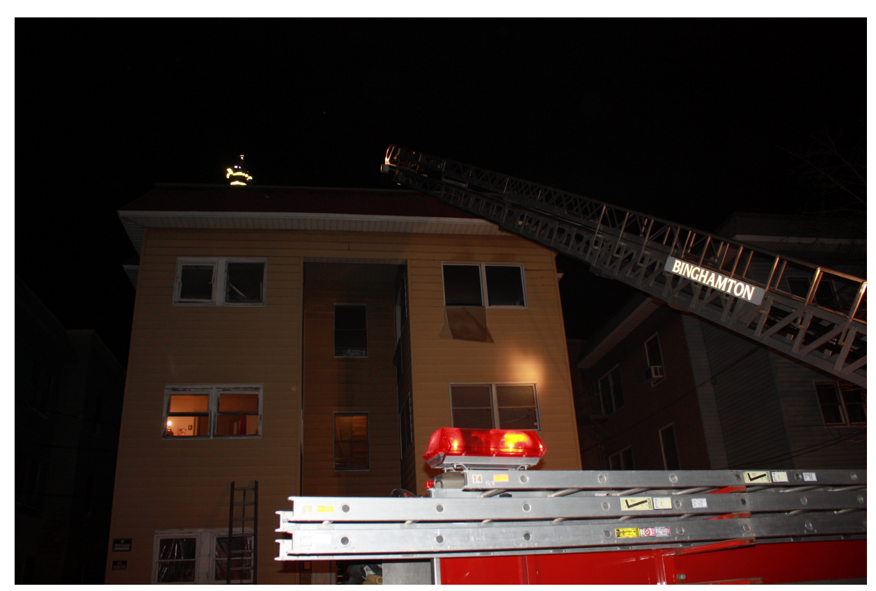
Part of Tower 21's crew operates on the roof during overhaul.