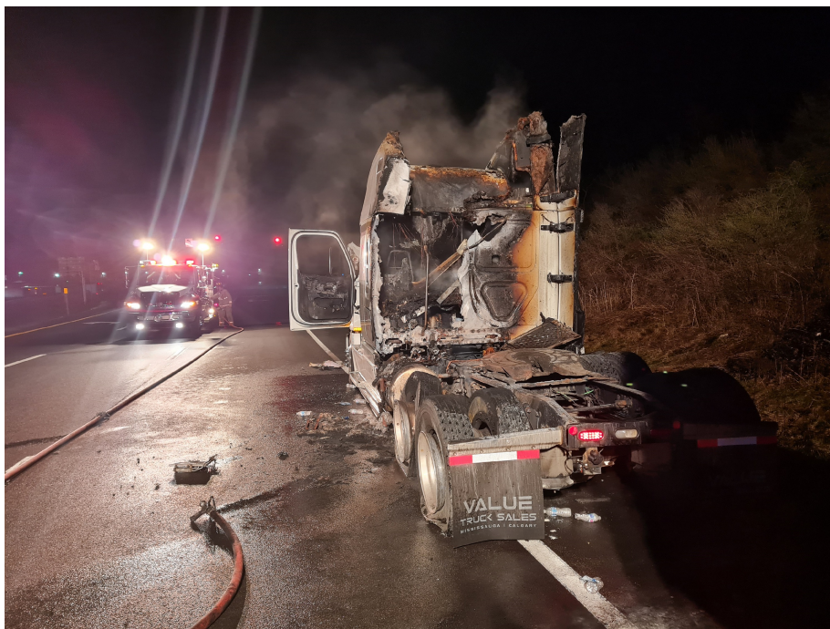
Squad 59's crew uses both lines to extinguish the fire.