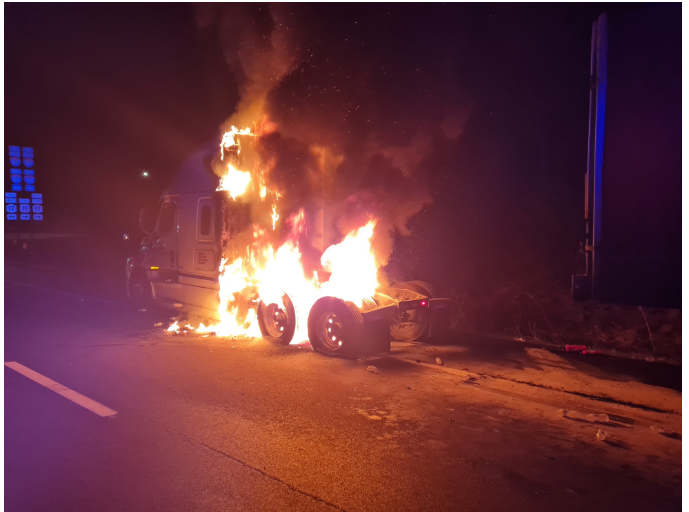
Rear of truck on fire upon arrival.

Squad 59 arrived to find the tractor detached from the trailer and pulled about 20 feet forward