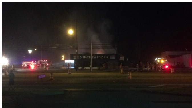
Fire can be seen on the roof shortly after the main body of fire had been knocked down

knocked down within a short time of arrival, overhaul operations continued for an extended period of time.