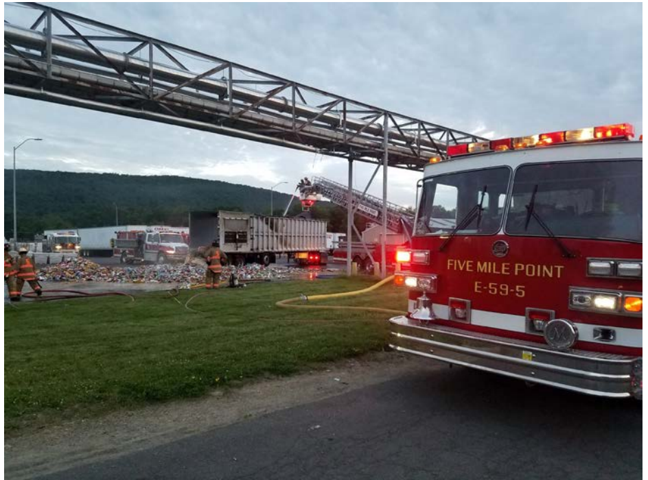
Crews continue to empty the trailer and extinguish hot spots.

With fire contained in the compactor crews began unloading the trailer which was about half full of chips and bags. Crews continued to douse fires within the pile of chips as they unloaded the trailer. After unloading a portion of the trailer crews decided to utilize Tower 59 to flood the trailer and aid in unloading the rest of the chips to make sure the fire was completely out.