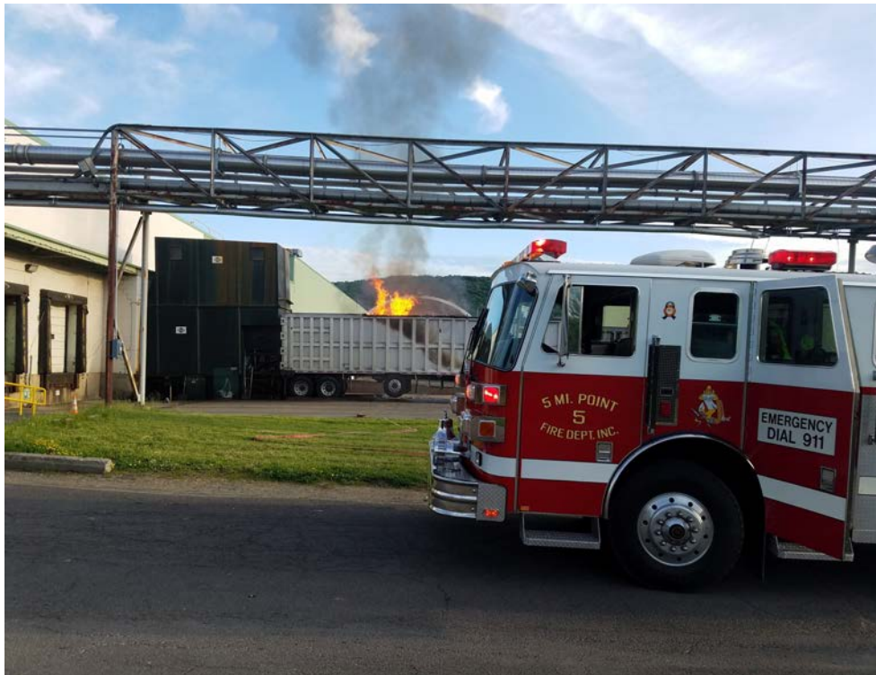
Engine 59-1 arrives on scene.

At 19:08 Hours on the evening of June 9th, 2018, Broome County Communications dispatched the Five Mile Point Fire Department (59) to 10 Spud Lane, Frito Lay, for a possible compactor fire at the rear of the building. Initial reports were that there was smoke visible from the compactor but no fire seen. Chief 59B went enroute and arrived to find a full size open top tractor trailer backed up to a compactor attached to the rear of the building with smoke and fire showing. Chief 59 then requested county re-dispatch the incident as a working compactor fire.